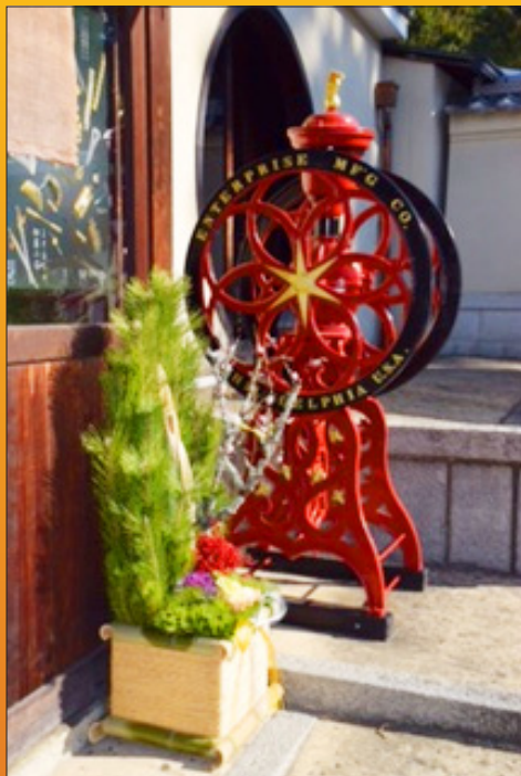
We caught the tail end of the new year with many homes & businesses displaying a traditional Black Pine arrangement.