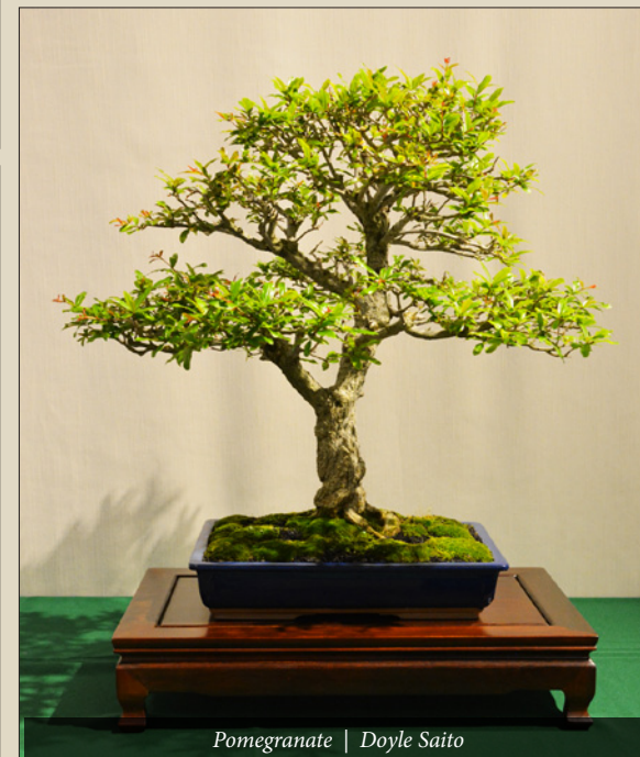
Pomegranate | Doyle Saito