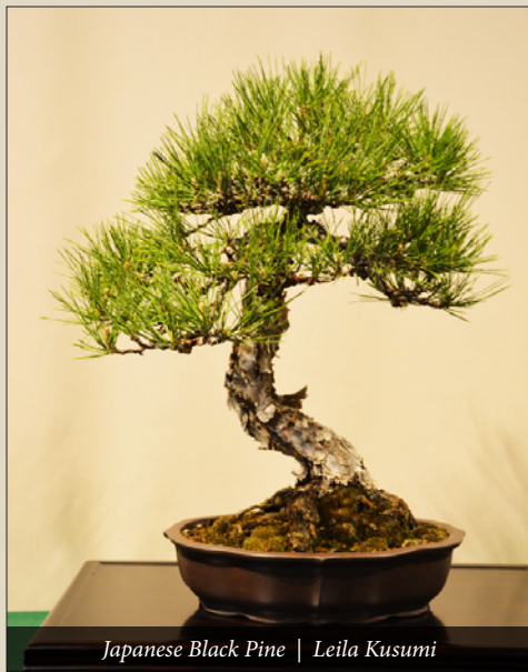
Japanese Black Pine | Leila Kusumi