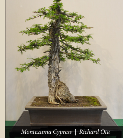
Montezuma Cypress