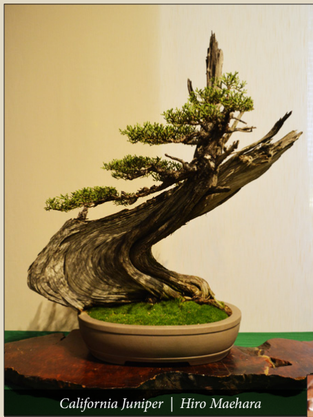
California Juniper