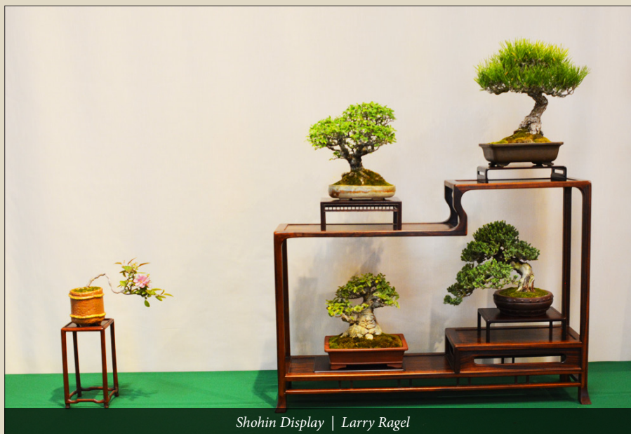
Shohin Display | Larry Ragel