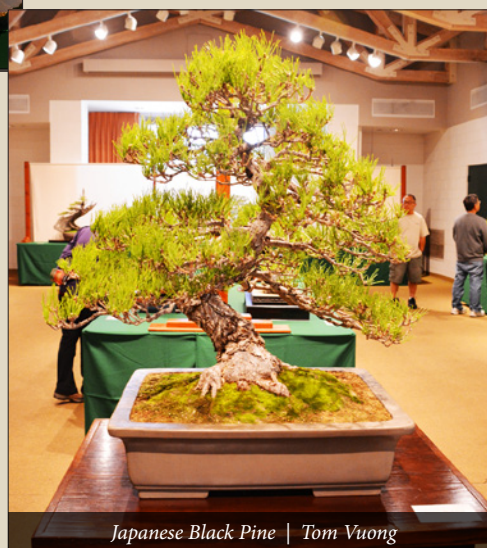
Japanese Black Pine | Tom Vuong