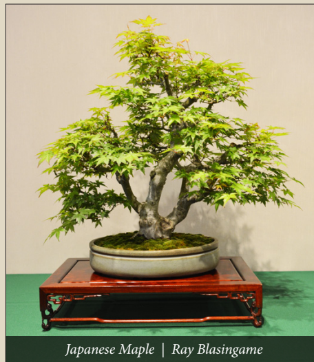
Japanese Maple | Ray Blasingame