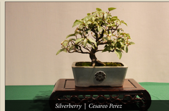
Silverberry | Cesareo Perez