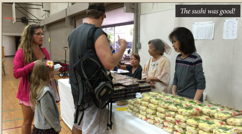
The sushi was good!