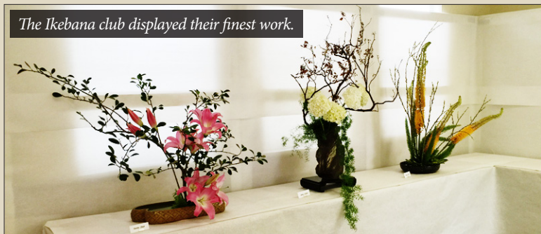
The Ikebana club displayed their finest work.