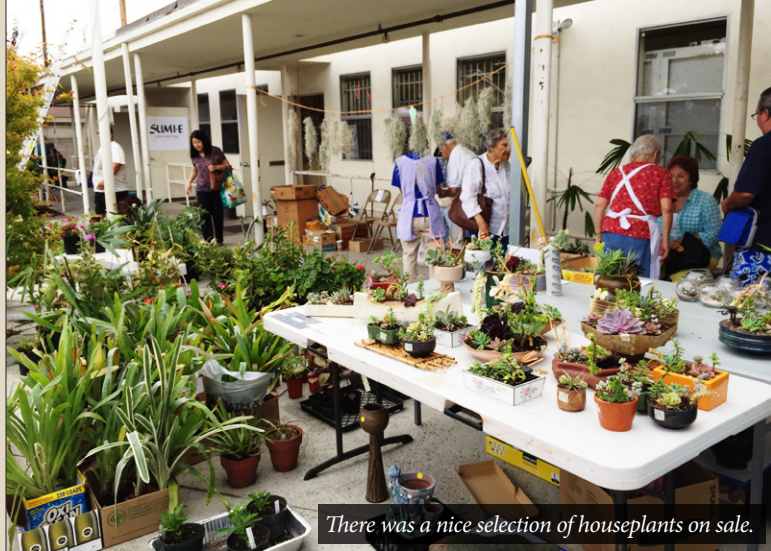
There was a nice selection of houseplants on sale.