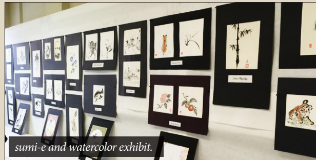
sumi-e and watercolor exhibit.