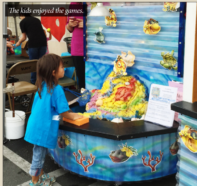
The kids enjoyed the games.