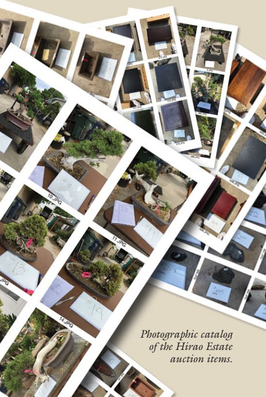
Photographic catalog of the Hirao Estate auction items.