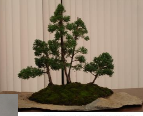
Clinging to rock style planting