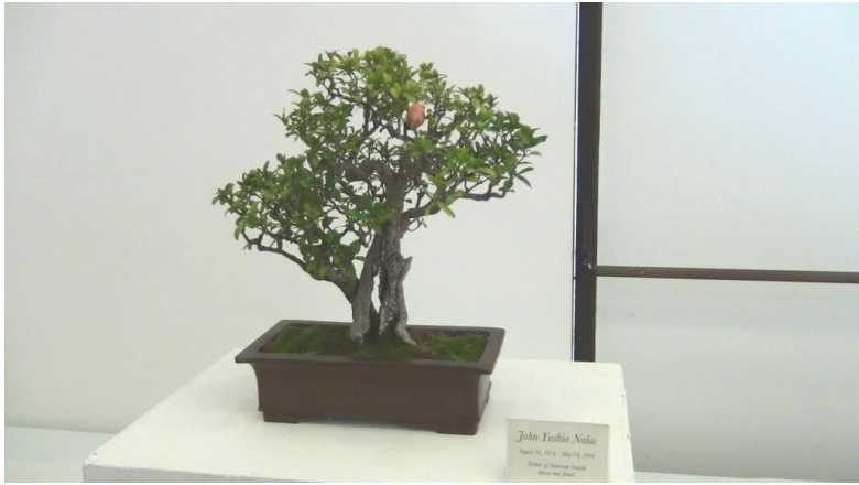
John Naka Dedication Tree