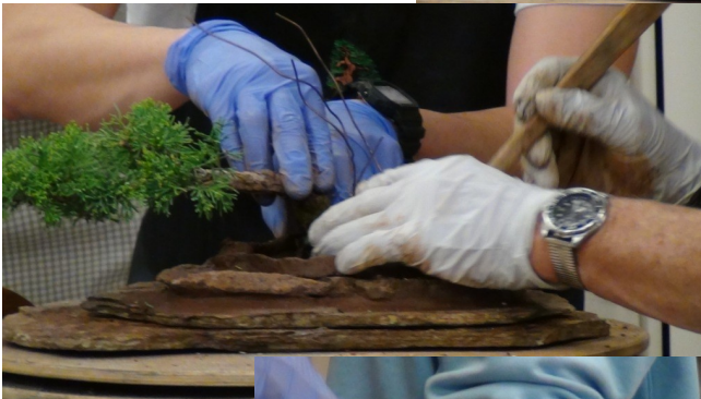
The muck walls are formed and tree attached