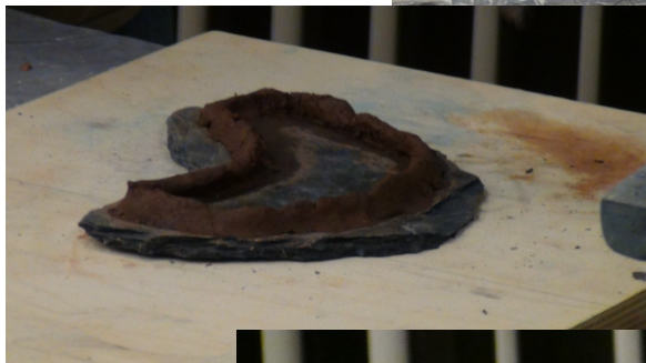
The modified slab with muck walls and the slab with soil and moss