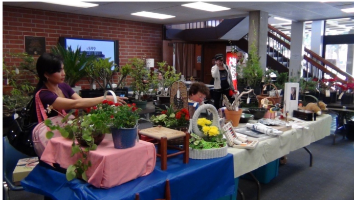
The Beginners Workshop