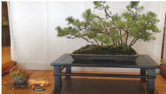
Frank Goya Prostrate Juniper