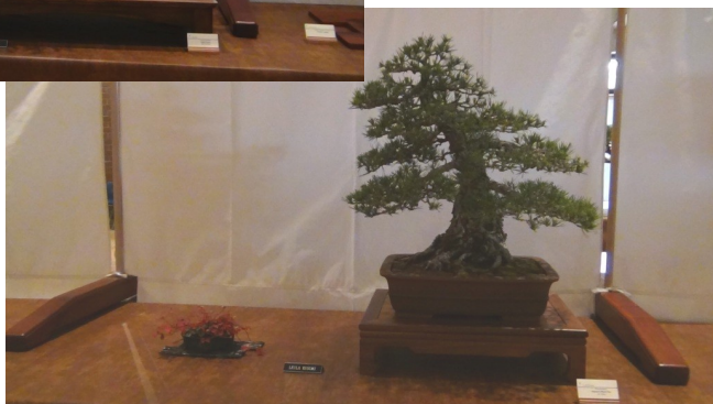
Leila Kusumi Japanese Black Pine