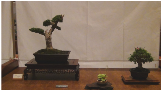
Tom Culton Boxwood