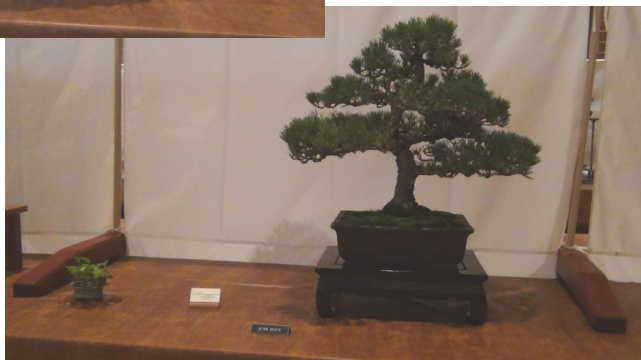
June Nguy Japanese Black Pine