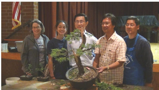
The winners of the raffle trees.