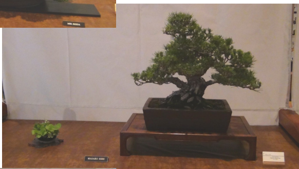
Mas Ishii Japanese Black Pine