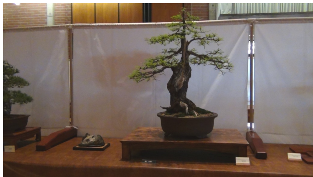
Kei Ikari Bald Cypress