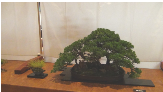
Mel Ikeda Procumbent Juniper 'Nana'