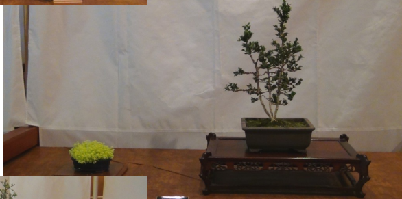
Lloyd Garver Triple trunk boxwood