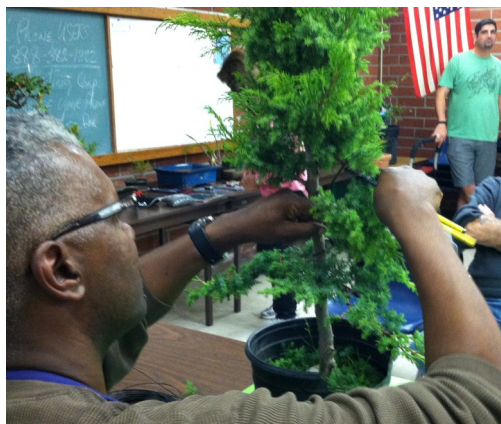
Lots of cutting and wiring without the use of gloves.