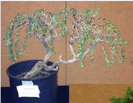
Leila Kusumi BYOT Suthin Workshop Results