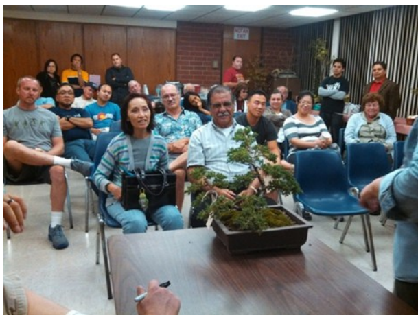
This year's Auction Trees.