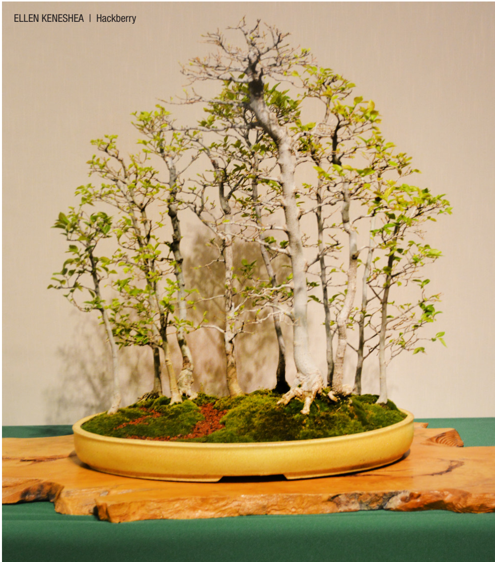
ELLEN KENESHEA | Hackberry