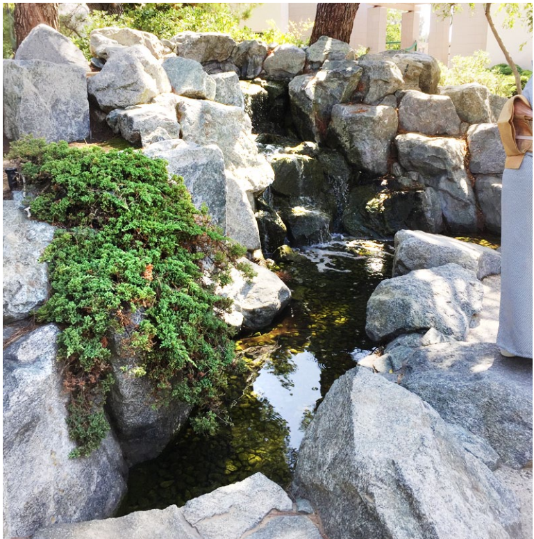
Below: A beautiful and tranquil waterfall at the Pine Wind Garden at the Torrance Cultural Arts Center.