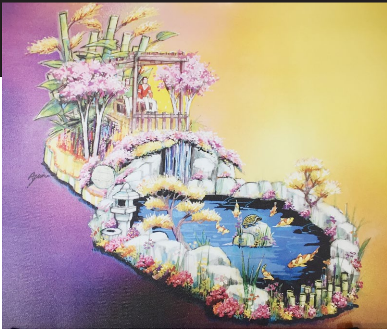
Above: The winning entry which will be turned into a full sized float featured in the next Rose Bowl Parade.