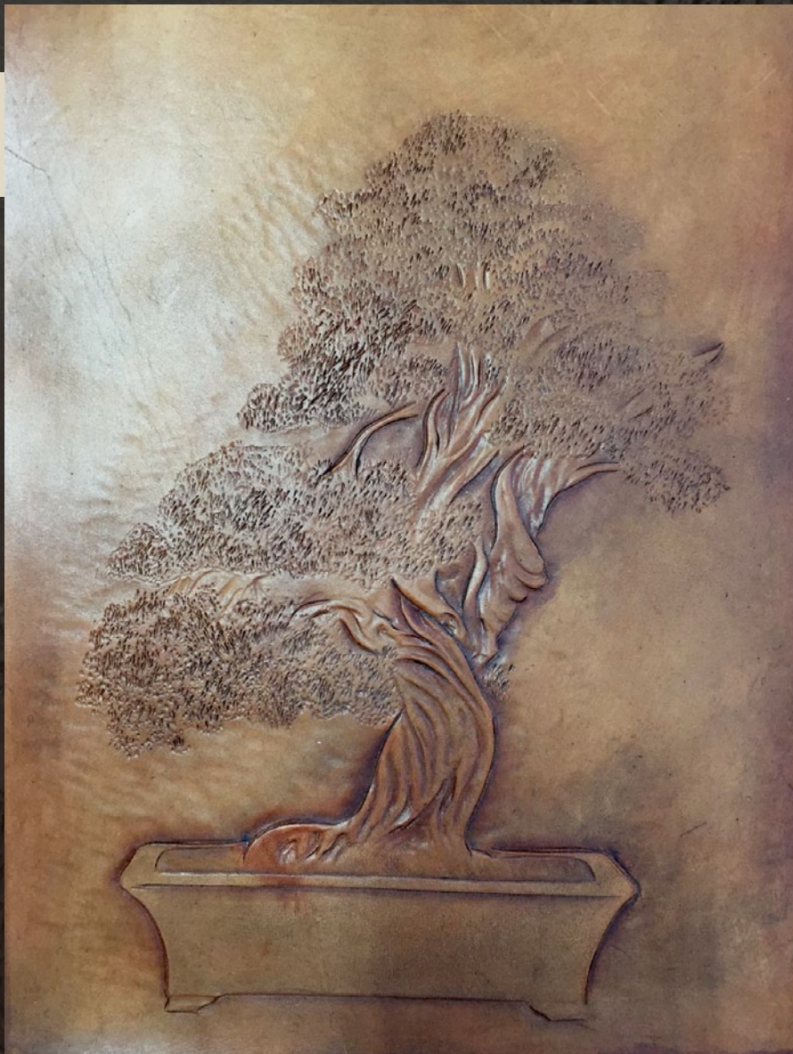
BONSAI ILLUSTRATION MEDIUM: CARVED LEATHER OWNER: LEILA KUSUMI